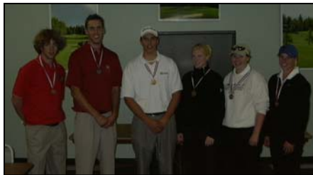
ACAC Golf Medalists